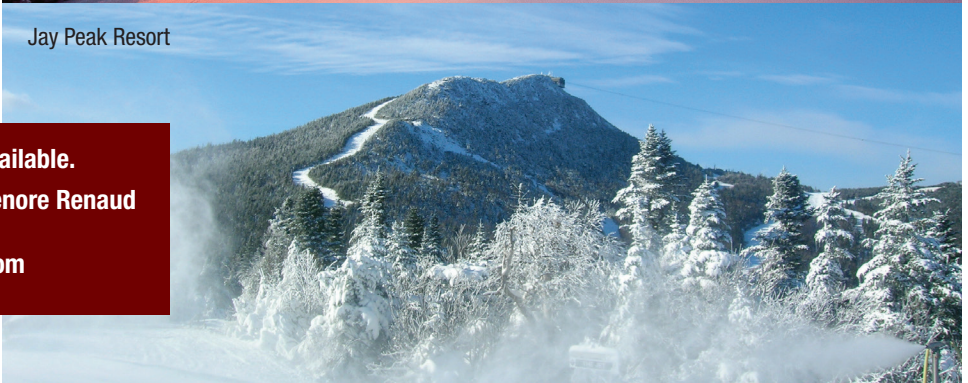
Jay Peak Resort

Two credits toward NWFA degree available. To reserve a place please contact Lenore Renaud by March 6th at 802-472-8700 or lrenaud@vermontnaturalcoatings.com